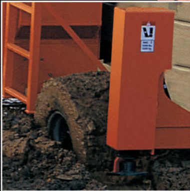
Unmatched Rough Terrain Performance