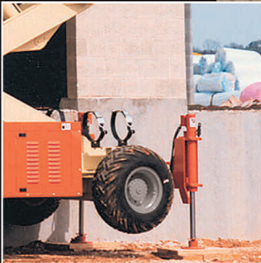
Independently Controlled Leveling Jacks for Enhanced Performance